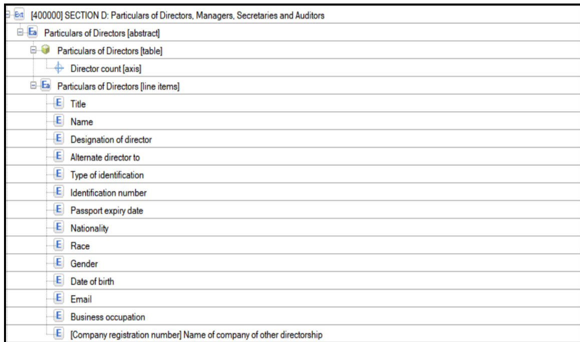
Illustration 4: Hierarchical representation of typed dimensions defined in taxonomy