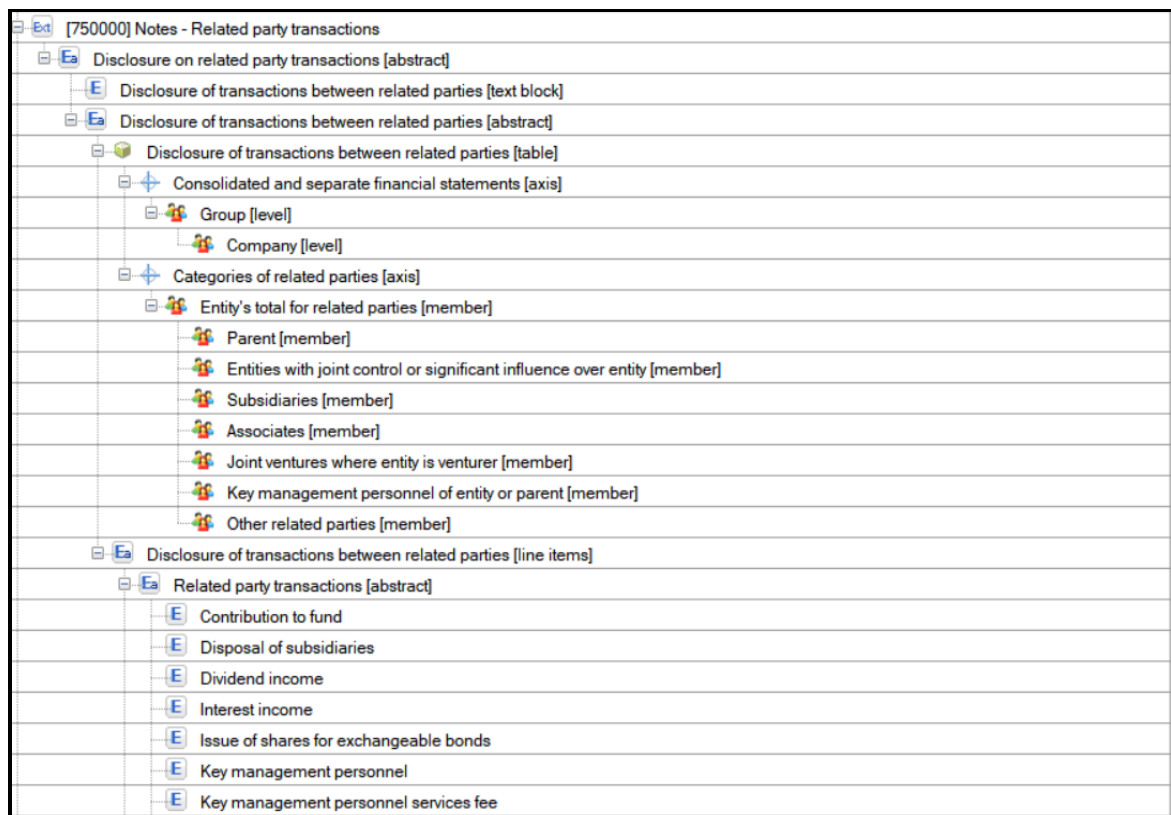
Illustration 2: Hierarchical representation of explicit dimensions defined in taxonomy

Illustration 2 provides example of the “Notes–Related Party Transactions”. In these illustrations, the categories of related parties i.e. Parent, Associate, Subsidiaries etc. (referred as domain members) are pre-defined in the SSMxT. The amount for each type of transaction i.e. revenue from sale of good, services received etc. can be reported for any or all categories of related parties.